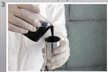
Fill HVLV Spray Gun